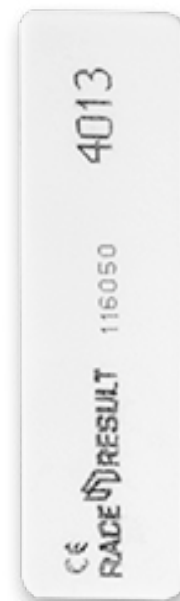
RACE RESULT Passive Transponder