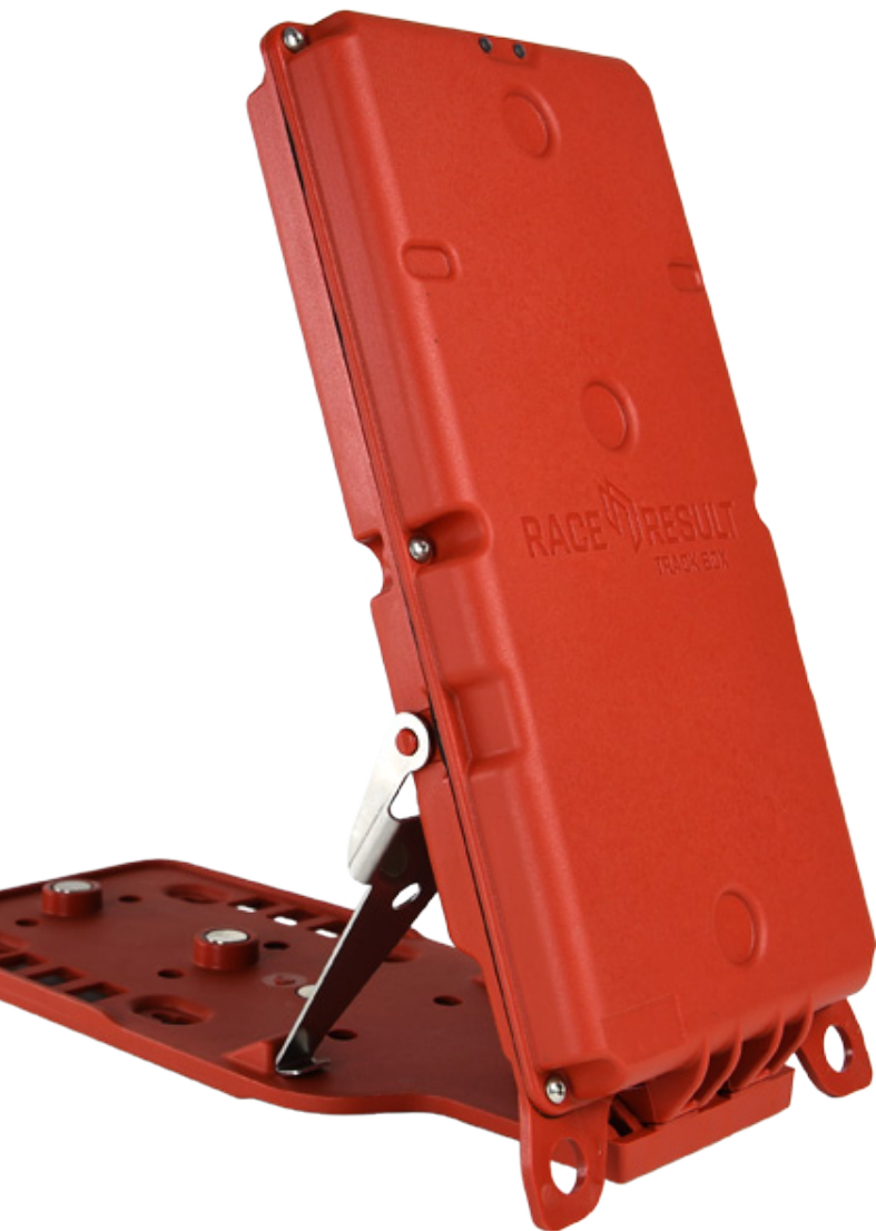
RACE RESULT Track Box Passive

At the upper parking lot, the Track Box is installed on the side of the lodge with an information board and under a small overhang. At the lower parking lot, the Track Box is installed on a pole at the edge of the parking lot where skiers enter the trails. Both locations have direct power going to the track boxes. In case of a power outage, the internal battery will keep the track boxes running for at least 10 hours.